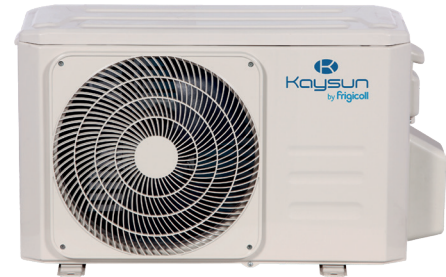
KID-05.3 S Standard